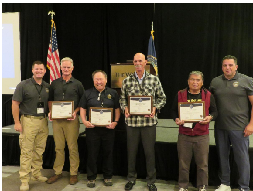
Califronita Chapter FBINAA Life Members

Five members with 25 plus years, receive certificates recognizing their FBINAA Life Member status.