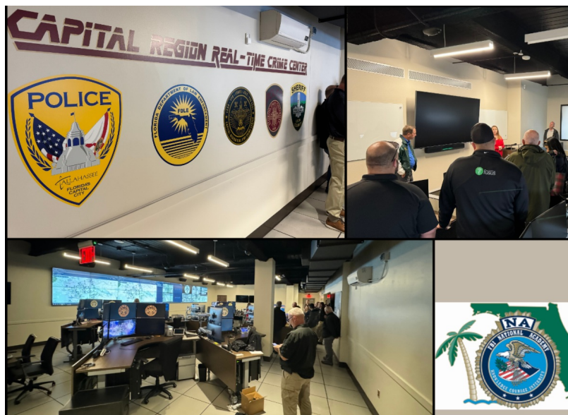
Capital Region Real Time Crime Center