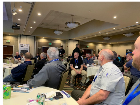
SAFLEO Training on Officer Suicide Prevention

The Utah Chapter 2023 Fall Conference was held November 5th - 7th, 2023, in St. George, Utah.