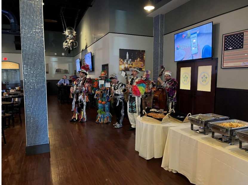
Session 288 Philadelphia Trip

On October 28th, 2023, Chapter members welcomed Session 288 to the City of Philadelphia. The members of 288 got a chance to see Philadelphia and enjoy lunch at the 7C Lounge inside FOP Lodge 5. The lunch consisted of Philadelphia staples like soft pretzels and cheesesteaks while a string band performed for our guests.