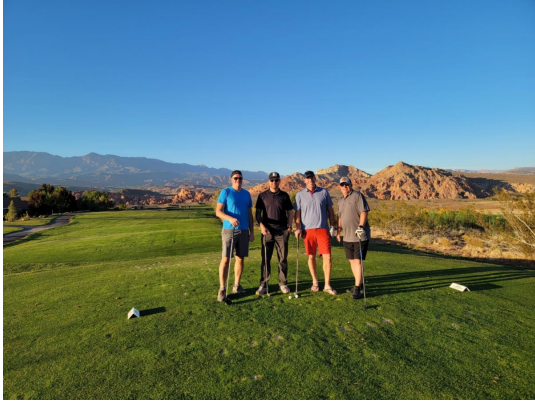
Golf Tournament - First Place Team