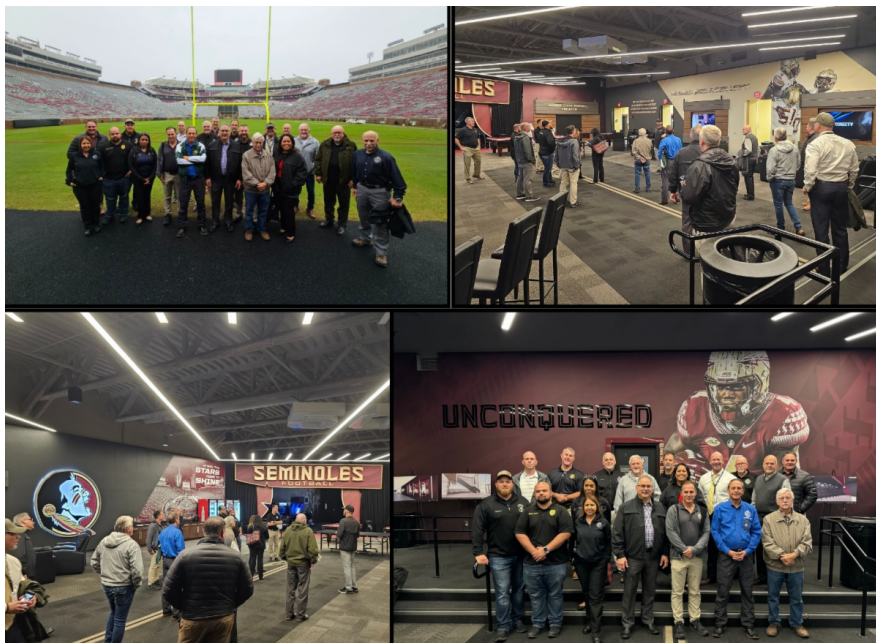
Florida State University Trip

On November 15th, 2023, Florida Chapter members recently dived into the vibrant world of college sports at FSU's Doak Campbell Stadium and explored cutting-edge law enforcement tech at the Capital Region Real Time Crime Center. The stadium tour offered insights into college athletics' rich history and iconic landmarks and at the Crime Center, attendees witnessed technology's crucial role in ensuring public safety. Lunch, courtesy of Motorola Solutions, and door prizes added to the day's enjoyment. Thanks to all participants, our sponsor, and everyone involved for making this a memorable experience.