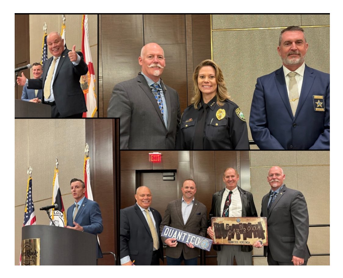
Holiday Luncheon at Seminole Hard Rock Hotel

A holiday luncheon was held at the Seminole Hard Rock Hotel and Casino on December 7th, 2023.