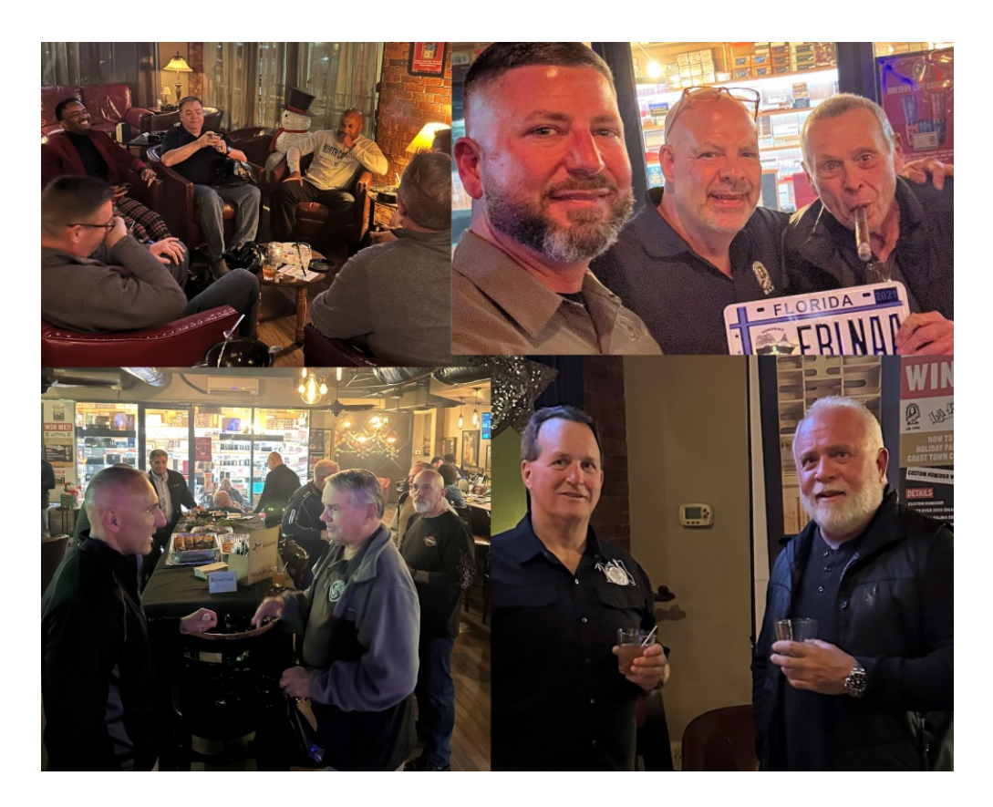
Cigar Bar Event- Cape Coral, Florida

On November 28th, 2023, Florida FBINAA Chapter and Southwest Florida Police Chiefs Association (SWFPCA) members spent some time at the World Famous Cigar Bar in Cape Coral, Florida for food, cigars, and fellowship.