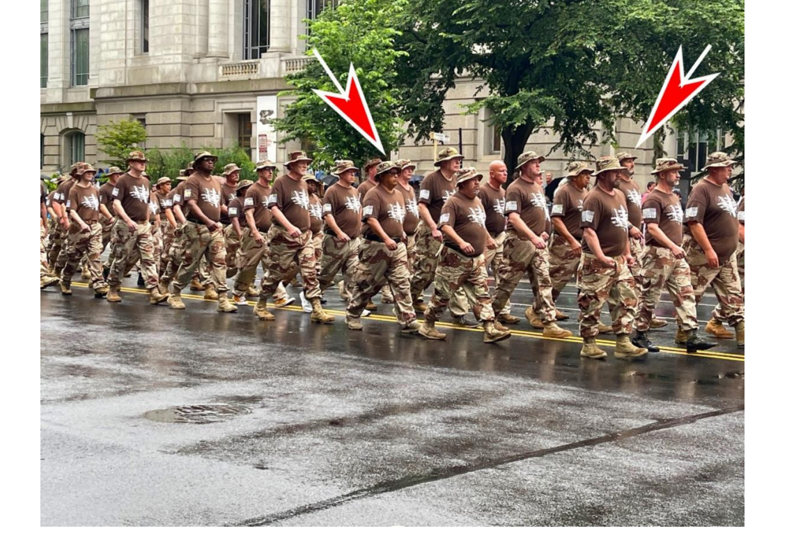
Chief Imboden and Deputy Commissioner marching in parade.