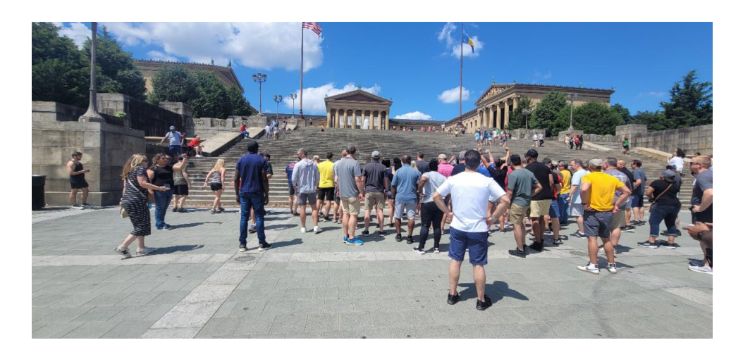
Session 287 at the Art Museum