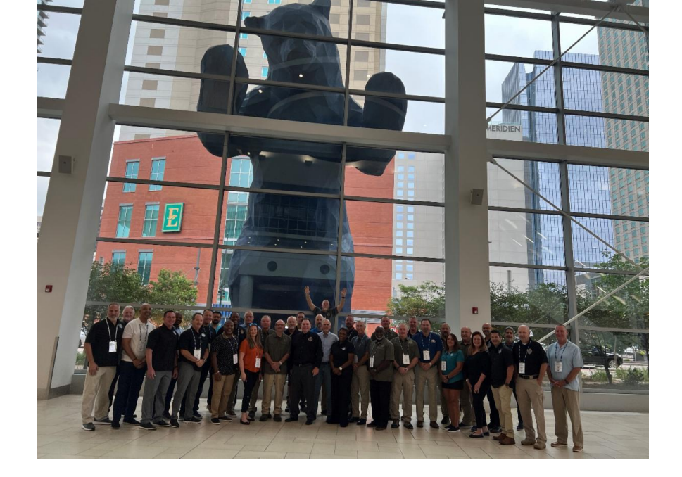
Florida Chapter Members in Colorado

Florida Chapter Members were represented well at the FBINAA National Conference in Denver, Colorado.