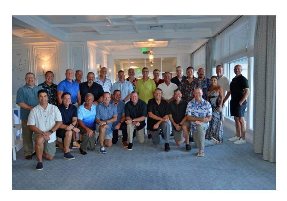
Hillsboro Club Florida FBINAA Event

Florida Chapter Members were represented well at the FBINAA National Conference in Denver, Colorado.