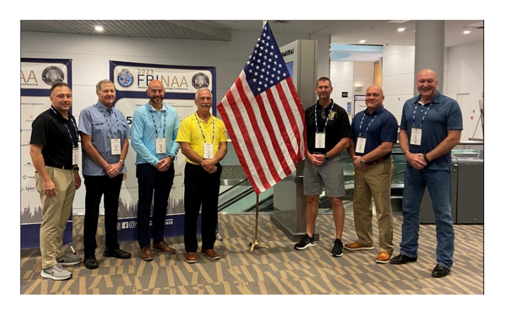
Indiana Chapter Members in Denver

17 Indiana FBINAA active members attended the national conference in Denver. The host chapter did an outstanding job and organized an amazing event. The training sessions and networking opportunities were exceptional.