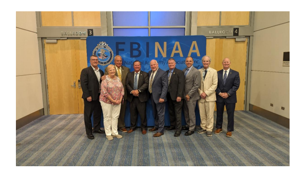
Eastern Pennsylvania Chapter Representatives at the FBINAA National Conference