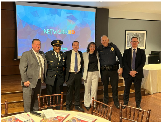
NA Session 284