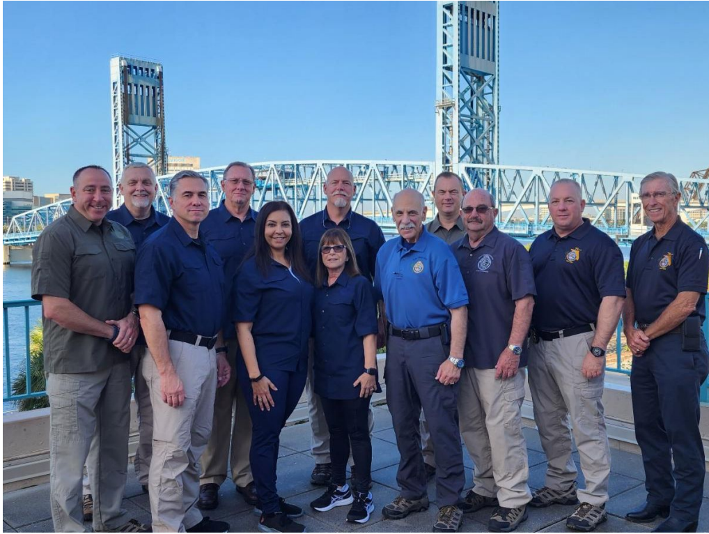
FBINAA Florida Chapter with Regional Representatives

On April 13th and 14th, the Florida Chapter Board and Regional Representatives met for a Board meeting in Jacksonville Florida.