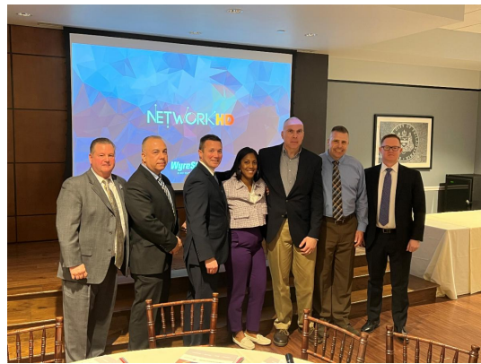
NA Session 285

On March 31st, 2023, the Chapter held a welcome back luncheon for the members of Session 284 and 285. The event was well attended and took place at the Philadelphia Police FOP Lodge 5. Thank you to those in attendance, and we hope to see our newest members at future events.