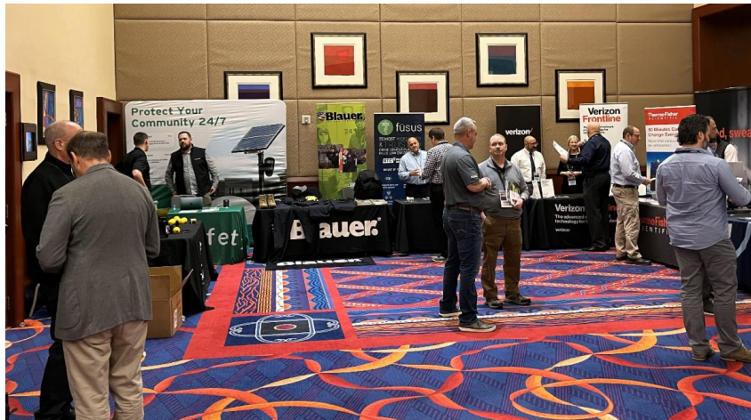
Vendor Exhibition at CT Chapter Regional Command College

The Connecticut Chapter hosted its first Regional Command College in March at the Mohegan Sun Resort and Conference Center. The event, attended by over one hundred law enforcement executives from the Northeast, provided top-notch training and networking opportunities. We look forward to next year's event.