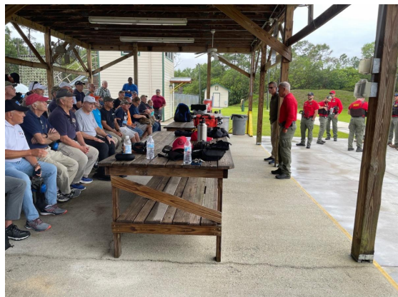
15th Annual Pistol Shoot/ HR 218 Event

On April 17th, 2023, the 15th Annual Pistol Shoot/HR 218 event was held at the Saint Lucie County Sheriff's Office Sergeant Gary Morales Memorial Range in Fort