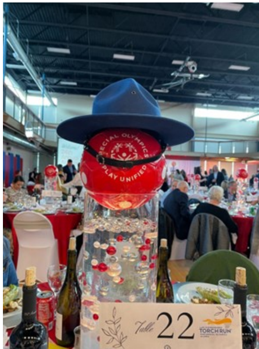
LETA Table with FBINAA Board