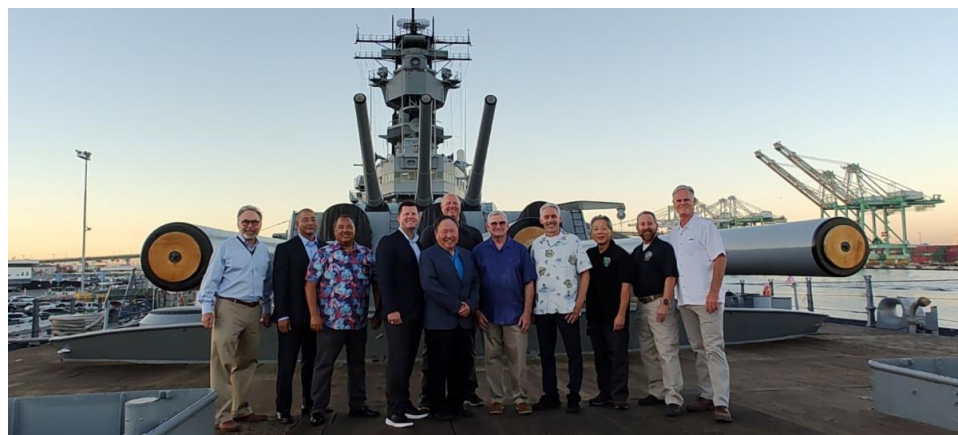
Past Presidents aboard the USS IOWA

California Chapter Board attended the FBINAA event at the IACP conference and met FBI Director Christopher Wray.