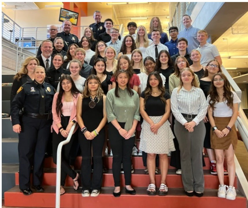
2023 ALEAD Graduating Class

This summer the Arizona Chapter graduated another group of future leaders from our Arizona Leadership, Education and Development (ALEAD) Academy in Flagstaff. The high school students from all around the state attended the weeklong academy. Thanks to all that helped host the academy!