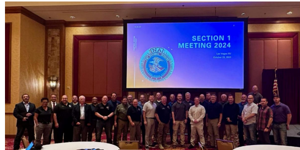
Chapter President, Treasurer and Secretary attended the Section 1 meeting.