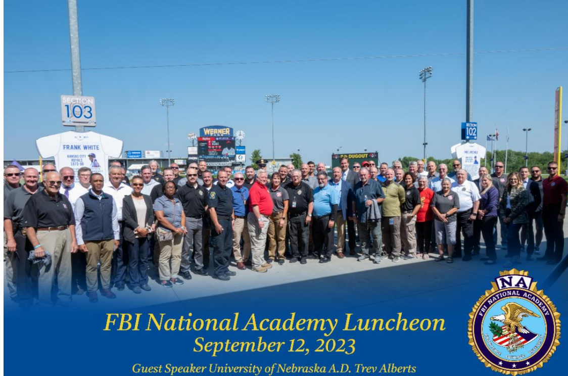
The Nebraska Chapter enjoys a day of baseball.