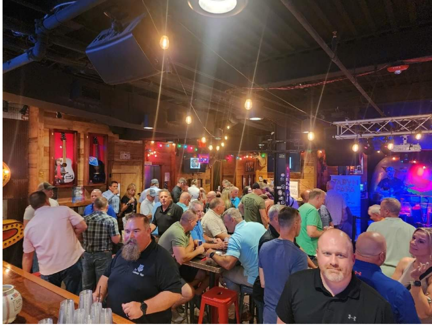
Monday Night's President Reception at Redneck Rivera