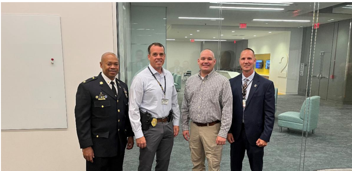
Executive Board and Members of NA Session 288

On September 21st, 2023, members of the Executive Board met with members of