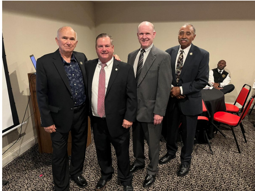
Life Members at the Welcome Back Event