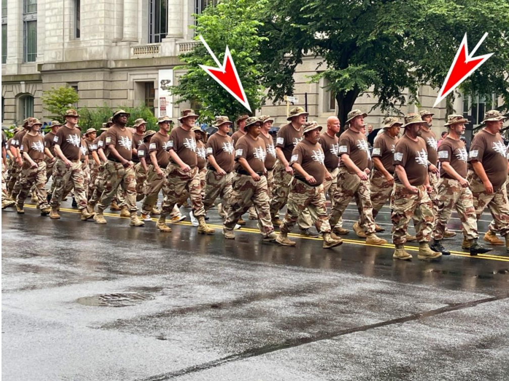
Chief Imboden and Deputy Commissioner marching in parade.