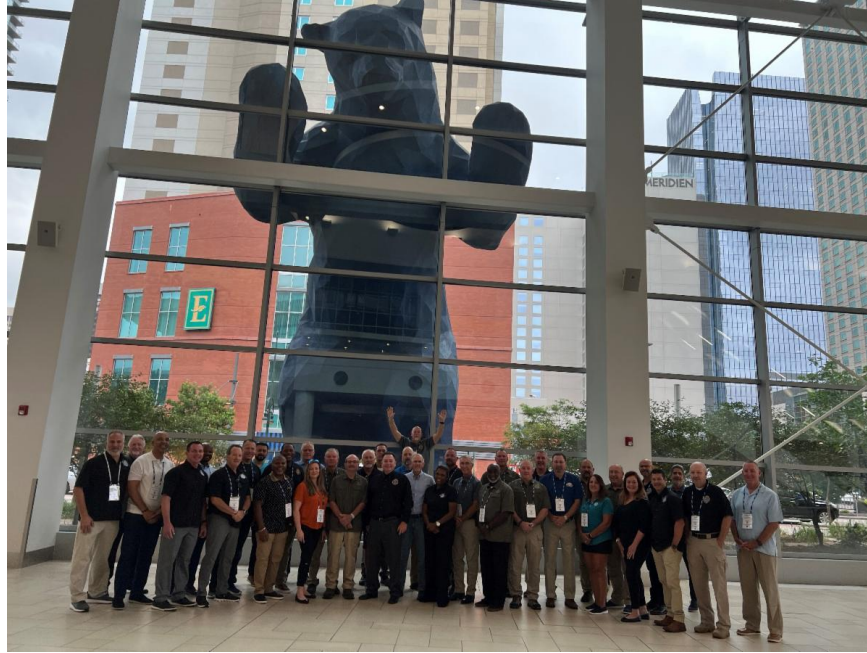
Florida Chapter Members in Colorado

Florida Chapter Members were represented well at the FBINAA National Conference in Denver, Colorado.