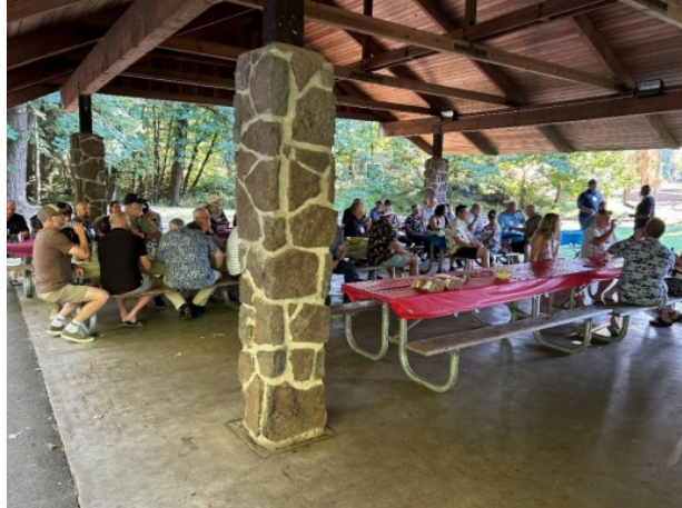
Oregon FBINAA Chapter "Pig Out"

A big thank you to all of you who joined us at the annual “Pig Out” this year. We had great weather and an excellent turn out...53! We all had the opportunity to enjoy excellent food and connect with Oregon chapter members and guests we have not seen in a while.