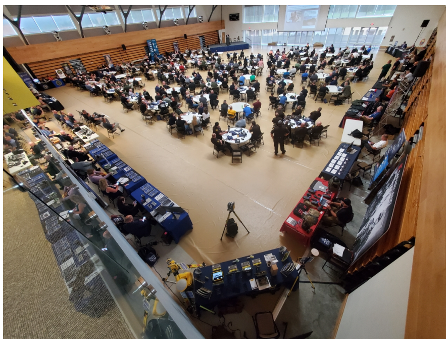
West Virginia FBINAA Training Conference Kick Off