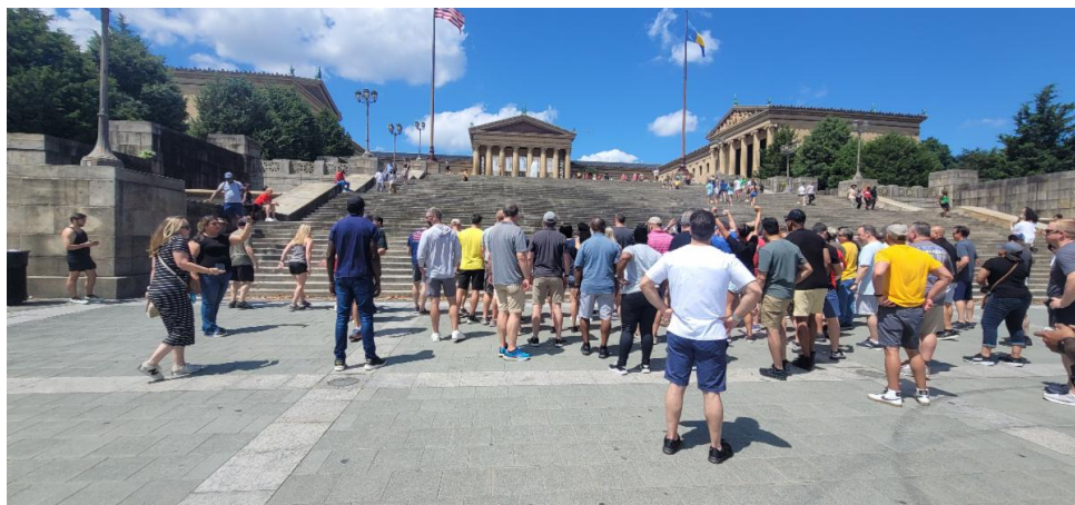
Session 287 at the Art Museum