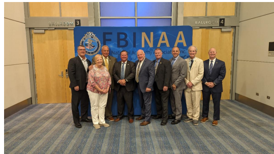
Eastern Pennsylvania Chapter Representatives at the FBINAA National Conference