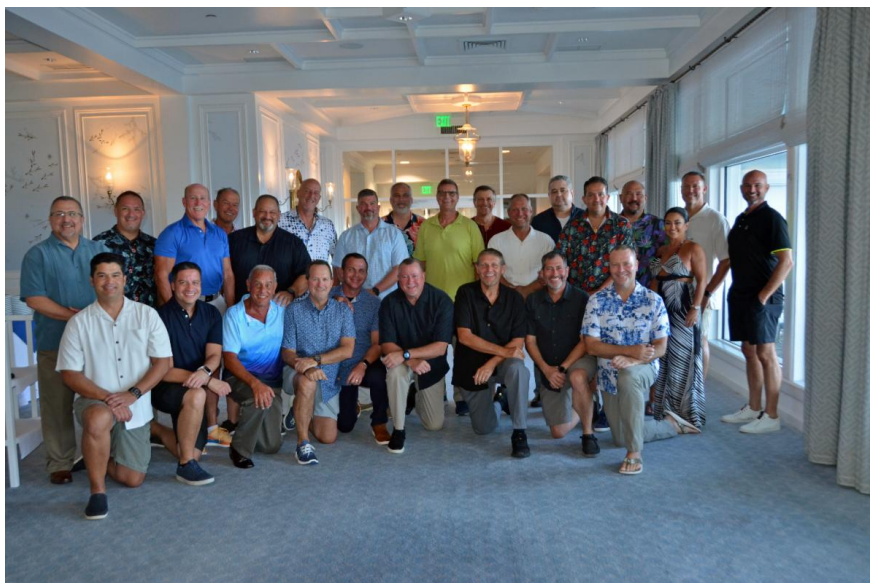
Hillsboro Club Florida FBINAA Event

Florida Chapter Members were represented well at the FBINAA National Conference in Denver, Colorado.