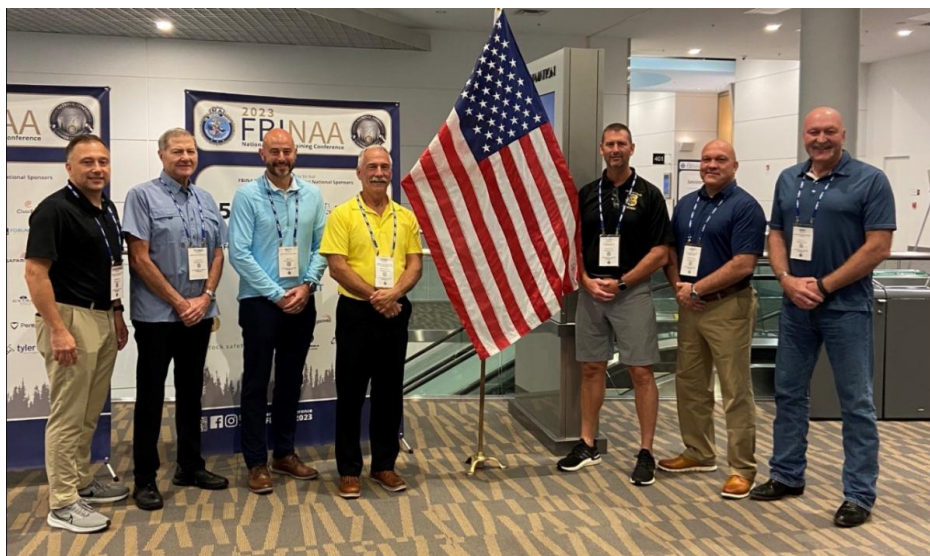
Indiana Chapter Members in Denver

17 Indiana FBINAA active members attended the national conference in Denver. The host chapter did an outstanding job and organized an amazing event. The training sessions and networking opportunities were exceptional.