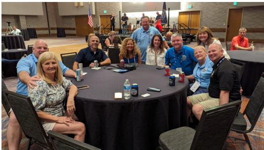
Eastern Pennsylvania Chapter

The Eastern Pennsylvania Chapter was well represented at this year's FBINAA National Conference held in Denver, Colorado. Thank you Rocky Mountain Chapter for an excellent conference and hospitality!