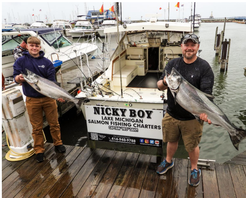
"The Fish Were Hitting"