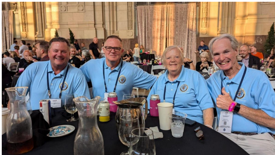
Eastern PA attendees at the 2024 NATC

The 2024 FBINAA Conference in Kansas City was huge success and a good number of chapter members including our Executive Board were able to attend. Thank you to the Kansas/ Western Missouri Chapter for hosting.