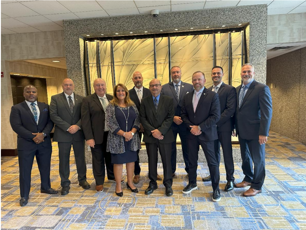
Florida Chapter attendees at the 2024 NATC

The 2024 National Annual Training Conference was a great event in Kansas City! We were fortunate to have a number of Florida Chapter members attend this year.