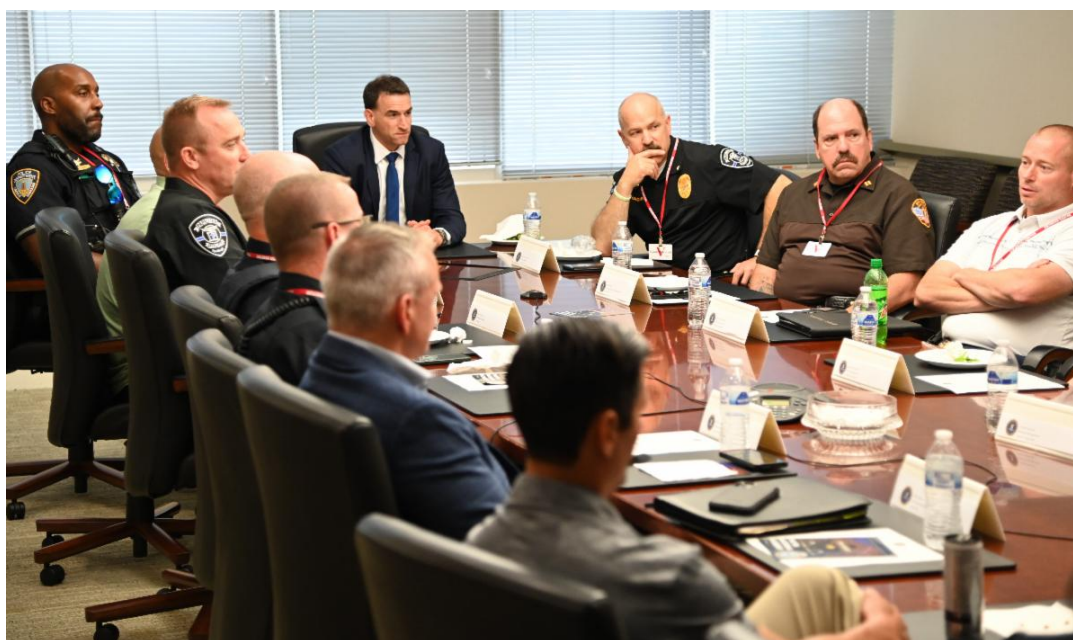
Continuation Outbound Meeting

On June 18th, recent National Academy graduates and board members from both Nebraska and Iowa Chapters met with SAC and ASAC at the FBI Omaha office to welcome officers heading to the 291st and 292nd NA Sessions. The informal luncheon was to explain various aspects of the National Academy to those outbound and to answer questions that they may have.