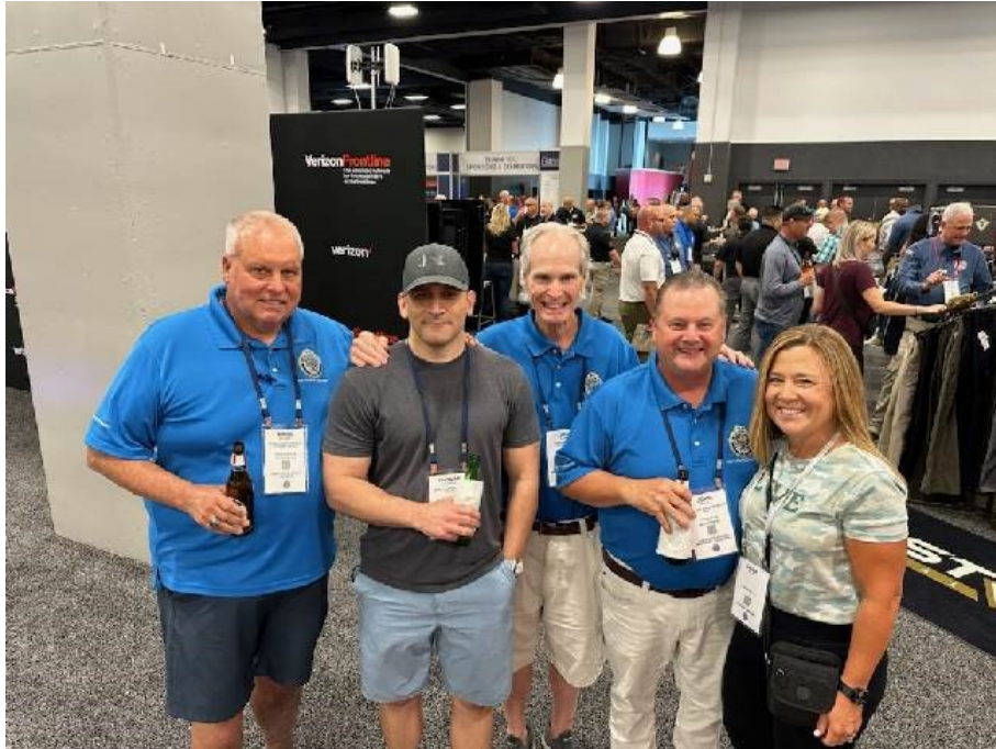
Eastern PA attendees at the 2024 NATC