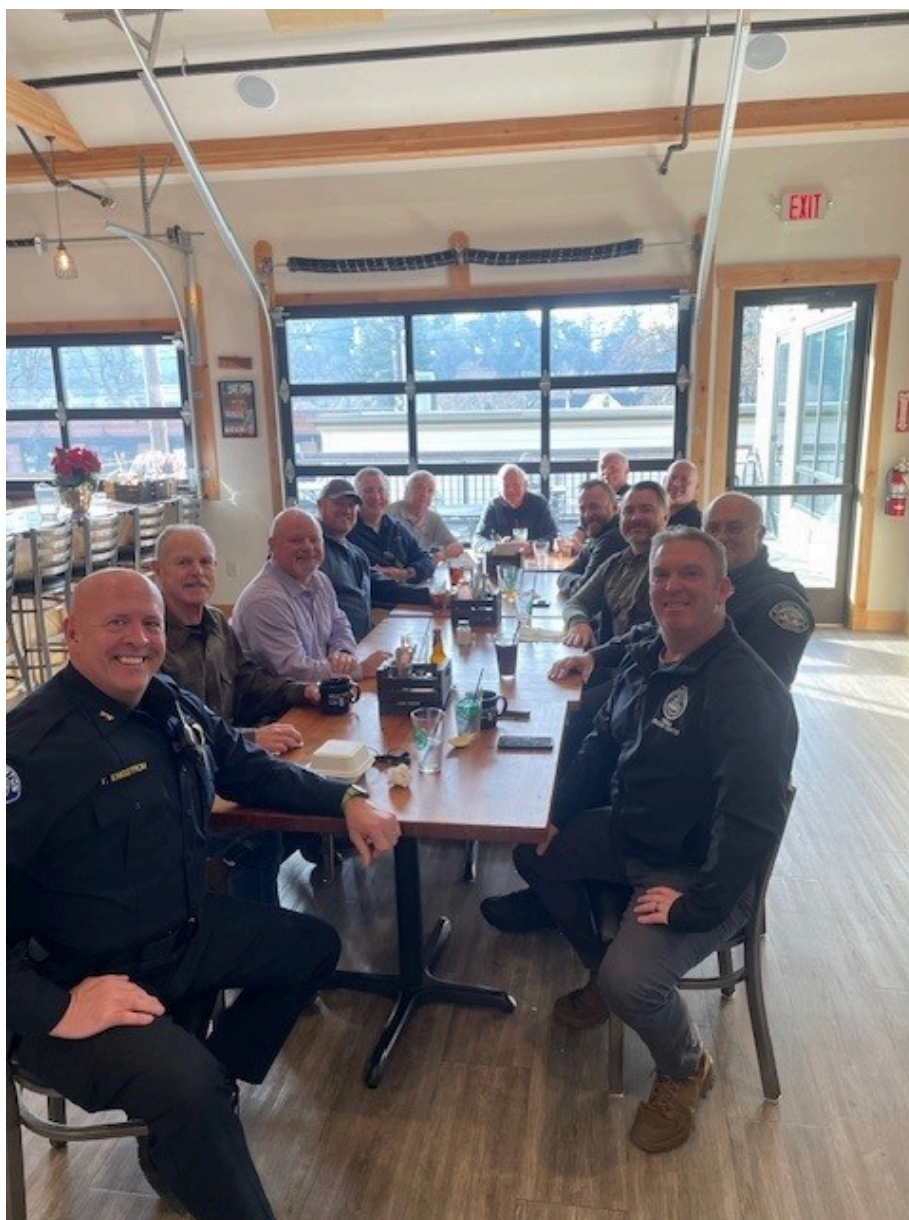
Regional Lunch in Silverton

Fall Re-Trainer Conference: Mark your calendar for the 2025 Fall Re-Trainer Conference. The dates are September 16th - 19th and we are excited to announce that the conference will be held at the Running Y Ranch Resort in Klamath Falls (5500 Running Y Rd, Klamath Falls, OR 97601). Nestled in the heart of the Cascade Mountains, this premier location provides an inspiring backdrop for professional development and networking.