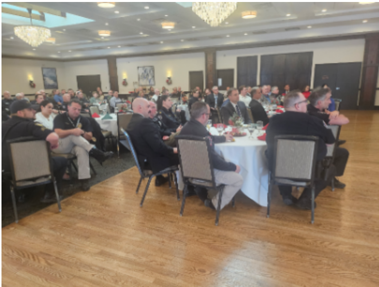
Members and guests listening to our guest speaker.