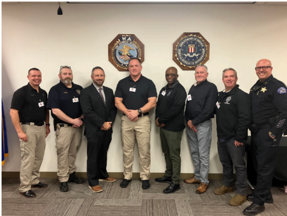
Meet and Greet