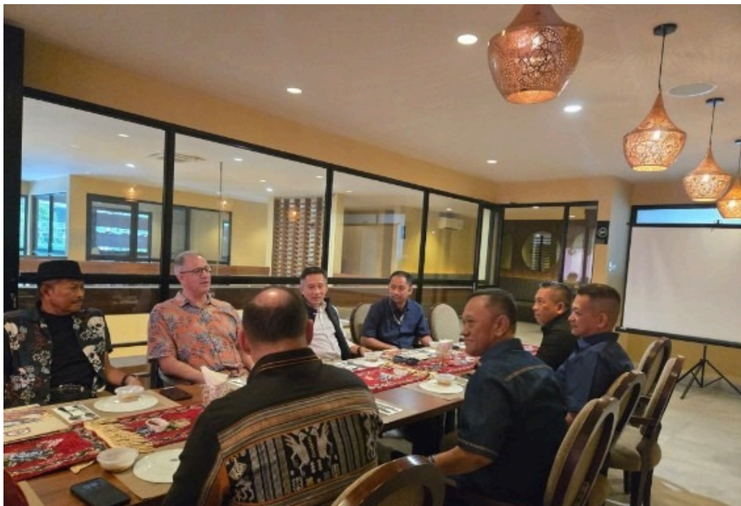
The Indonesian Graduate Team at their first planning meeting.