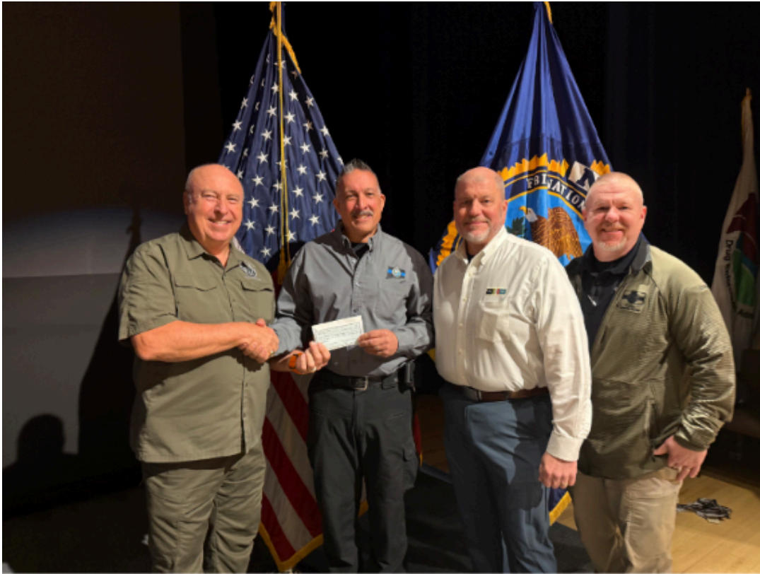
Connecticut Chapter Executive Board presenting a check to the FBINAA Charitable Foundation.