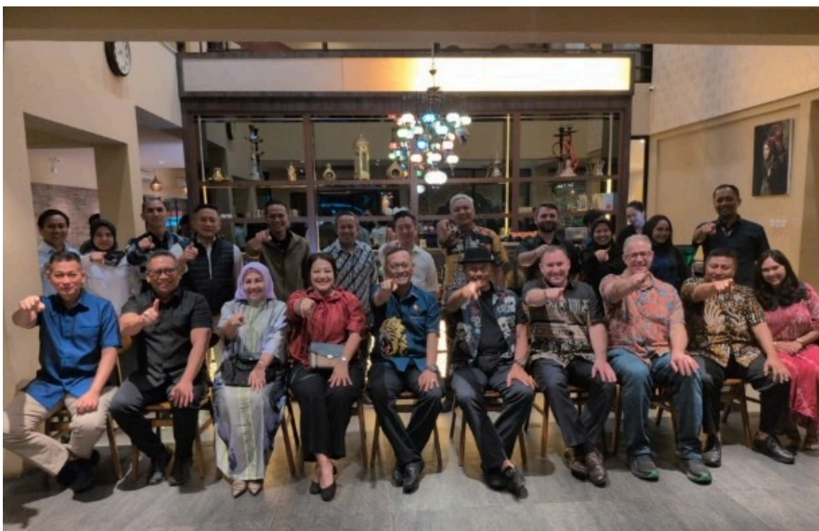
The Indonesian Graduates are reaching out to you to attend our Chapter conference!