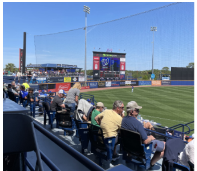
FBINAA members at Major League Baseball Game at Clover Park