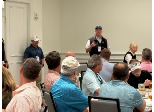
PGA Cognizant Classic Networking and Training Event

The Florida Chapter hosted the PGA Cognizant Classic Networking and Training Event we held on Thursday, February 27th, 2025.