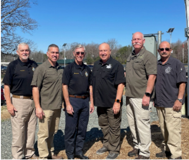
Members of the Florida Chapter Board

The event, open to FBINAA members as well as active and retired FBI agents, featured an exciting matchup between the Washington Nationals and the New York Mets. Attendees enjoyed a catered lunch and participated in a raffle, which raised $655 thanks to generous donations from the New York Mets.