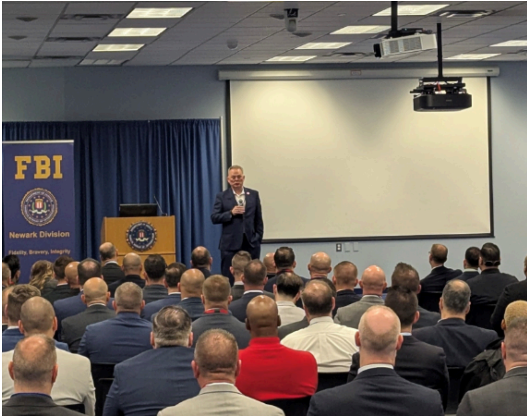
The FBINAA NJ Chapter co-hosted the Second Annual Leadership Seminar with the FBI Newark Field Office on Thursday, April 17, 2025.