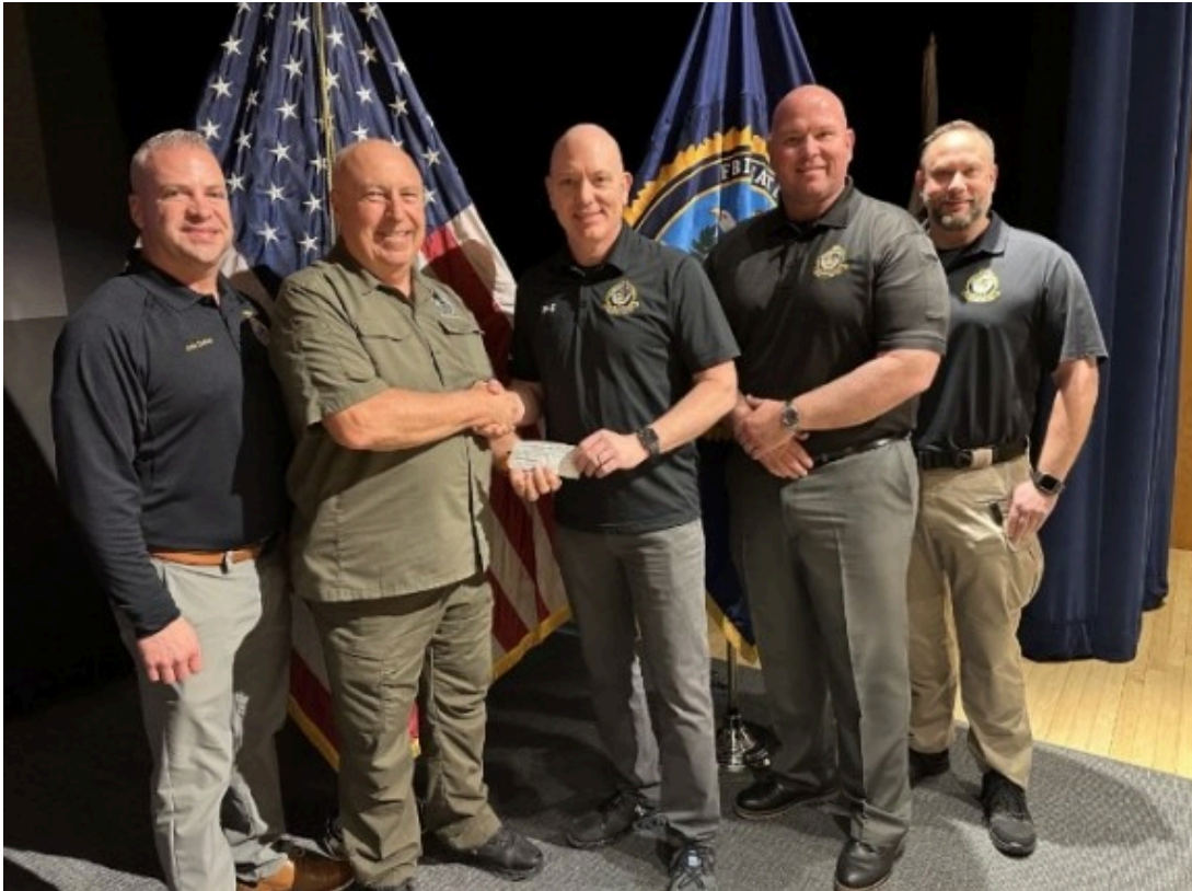
Chapter Leaders Attend the Chapter Leadership Summit