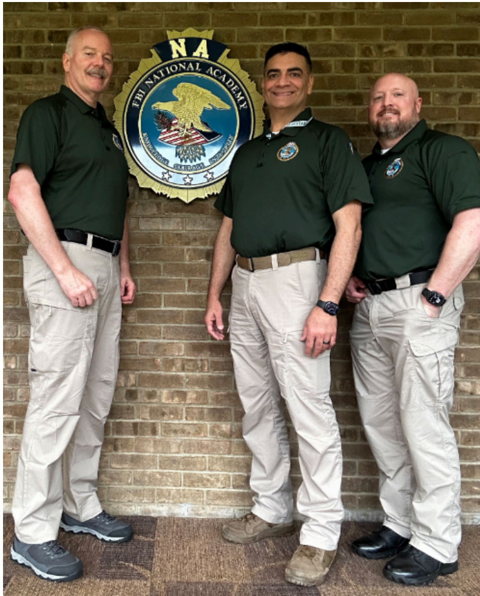
Oregon Students in NA Session 294