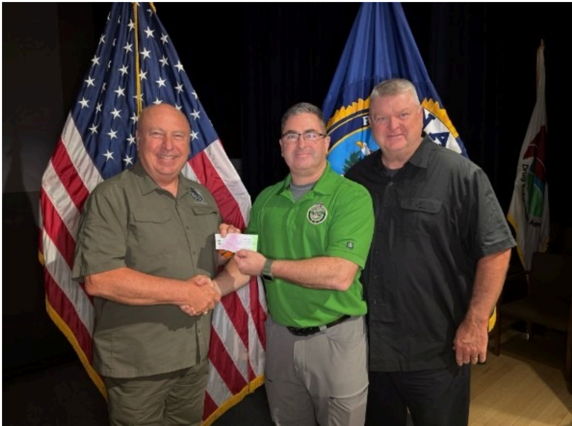
Nebraska Chapter Donation at CLS to National Academy Charitable Foundation