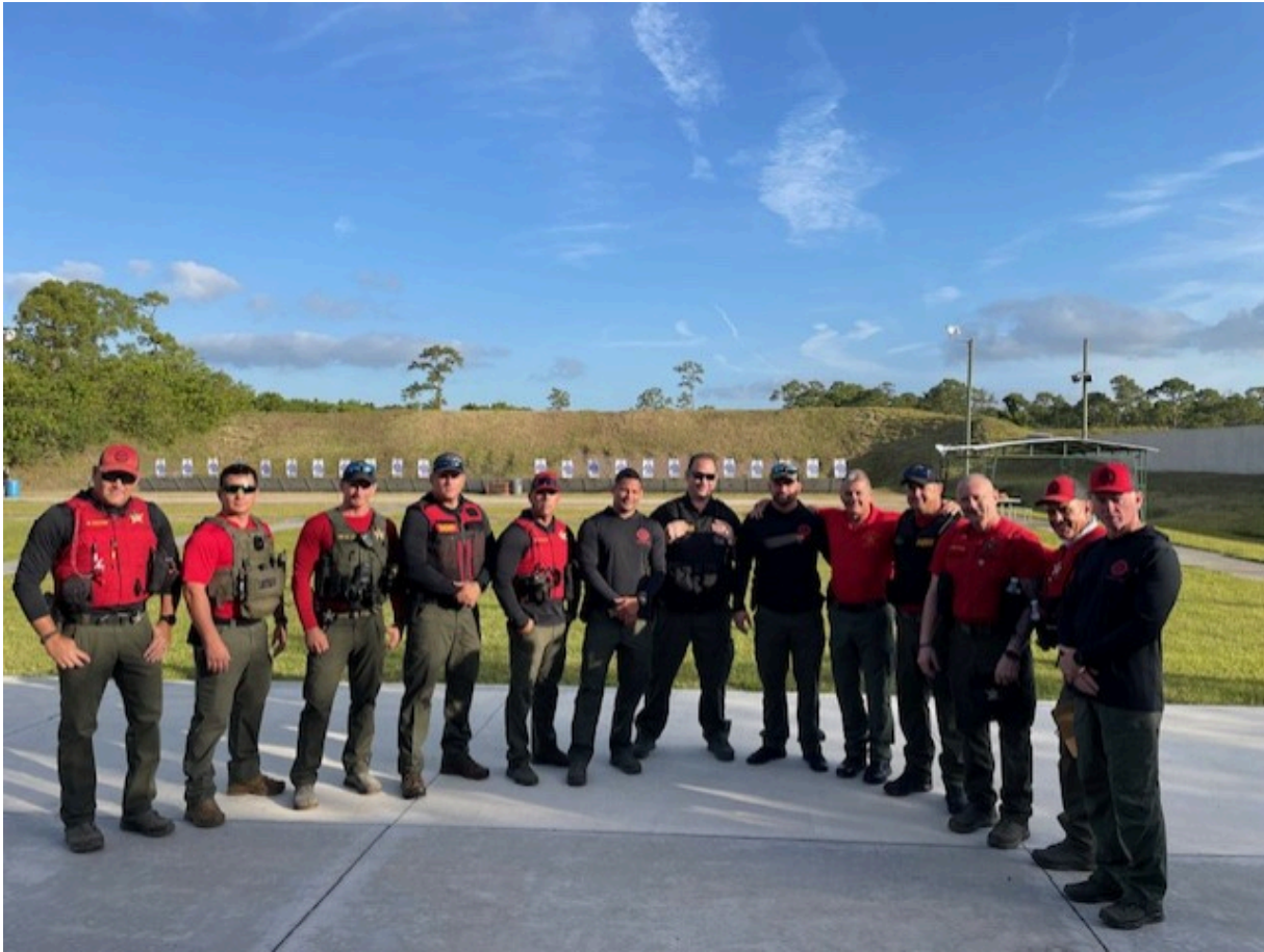
HR218 (LEOSA) Firearms Qualification Course

The Florida Chapter of the FBI National Academy Associates (FBINAA), in collaboration with the Society of Retired FBI Special Agents and the FBI Fort Pierce Resident Office, held a successful HR218 (LEOSA) firearms qualification course at the Sergeant Gary Morales Training Facility.