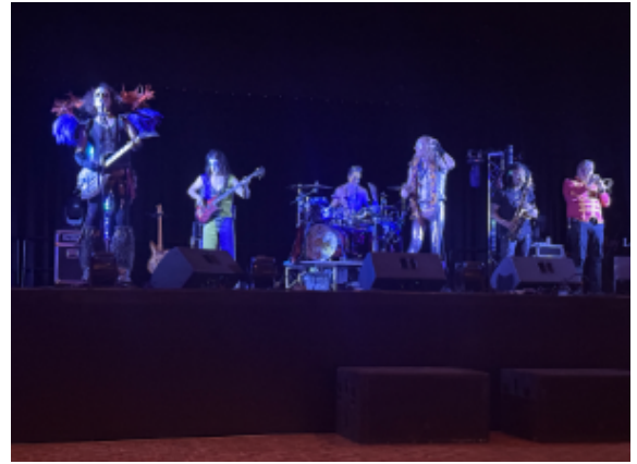
Bag of Donuts playing at the venue