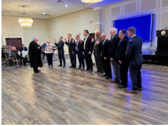
Executive Board Swearing In