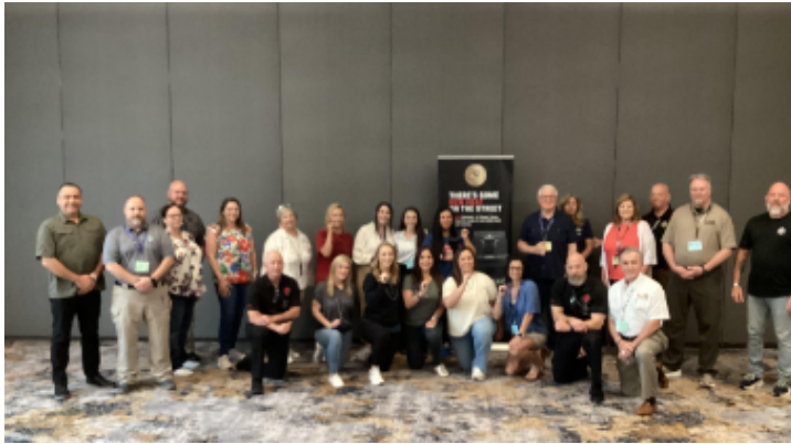
ASP "Be Your Own Defender" Participants