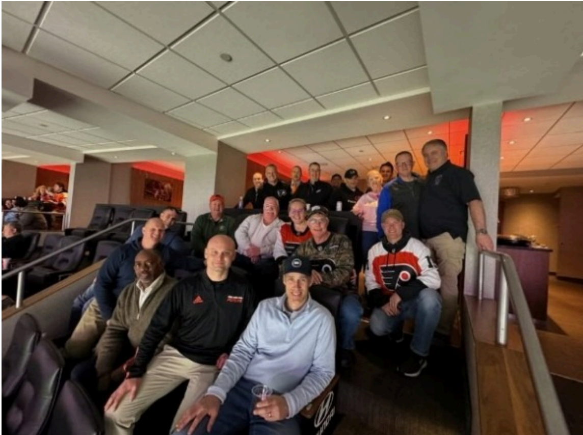
Philadelphia Flyers Game