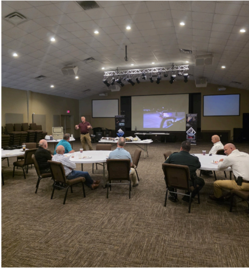
Fry, Fire & Supply Event

On April 23, 2025, the Florida FBI National Academy Associates hosted the Fry, Fire & Supply event at the Wakulla County Community Center. Co-sponsored by Federal Eastern International and Laser Shot, the afternoon brought together 19 NA members and law enforcement professionals for hands-on training, networking, and a classic southern fish fry. Attendees tested the Laser Shot simulation training system and explored the latest gear showcased by Federal Eastern. The event was a great success, blending professional development with camaraderie and great food.