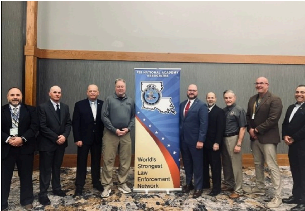
The Louisiana Chapter Board and Members of the National Board in attendance.

The Louisiana Chapter of the FBINAA hosted a highly successful annual conference at the beautiful Lauberge Resort in Lake Charles, Louisiana, from April 13th to 17th. The event kicked off with a warm welcome during the member and vendor reception, setting the tone for a productive and engaging week. Attendees participated in two full days of training sessions focused on leadership, retirement planning, and health and wellness in law enforcement—key topics that support the professional and personal growth of members. The exhibition hall featured an impressive 43 vendors, showcasing the latest in public safety technology and services. Guest events were well-received, including lively Mimosa Brunches, casino table game classes, and the empowering "Be Your Own Defender" class presented by ASP.