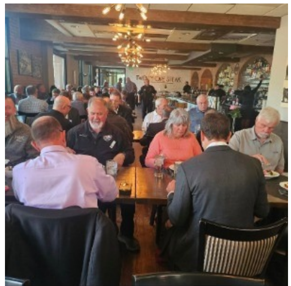
Luncheon at Twenty-One Steak