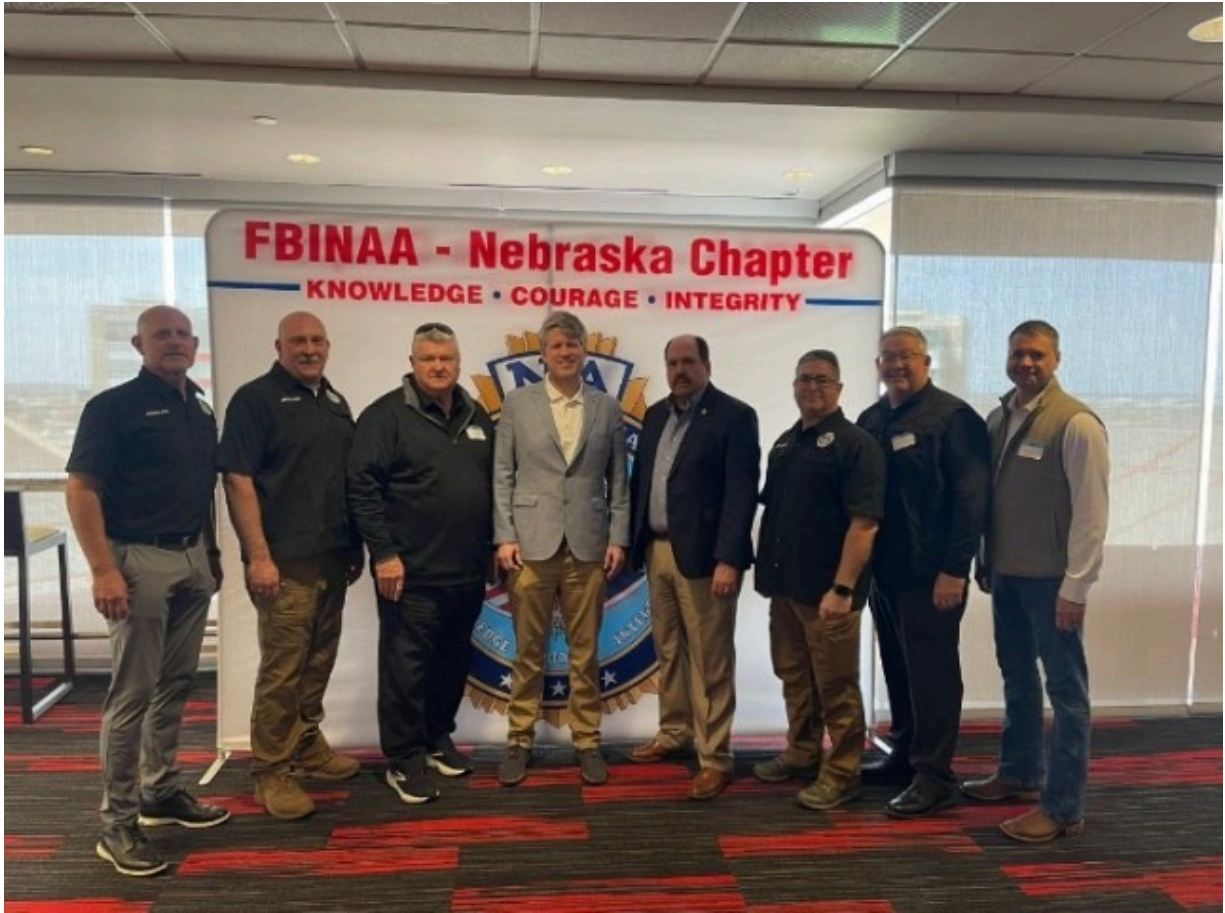
Nebraska Chapter Executive Board with Nebraska Attorney General