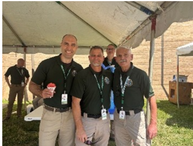
Session 298 at Carnival