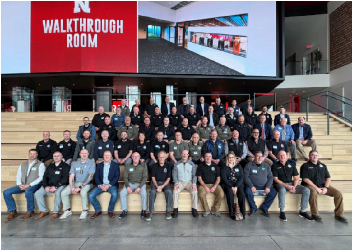
Group photo from Spring luncheon

The Nebraska Chapter gathered on April 8 for its annual Spring Luncheon, hosted by the University of Nebraska–Lincoln Police Department at Memorial Stadium.