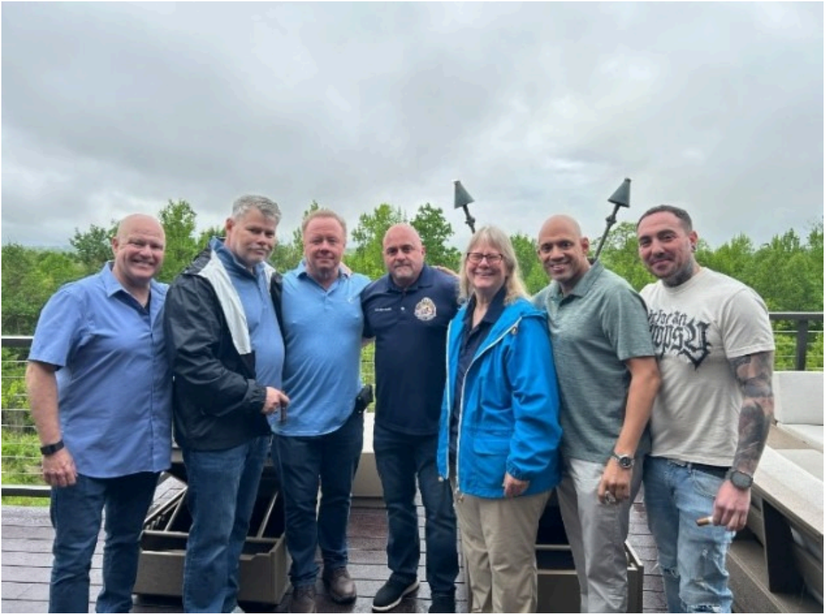
Western PA conference

Seven member of the Chapter attended the Western PA Chapter's Annual Retrainer at the Nemaocolin Woodlands Resort in Farmington, PA. The conference was packed with great educational sessions, supported by many vendors, and was a great opportunity to strengthen the great fraternal network that membership in the NA brings. Consider attending the retrainers of the chapters across the globe. You won't regret it.