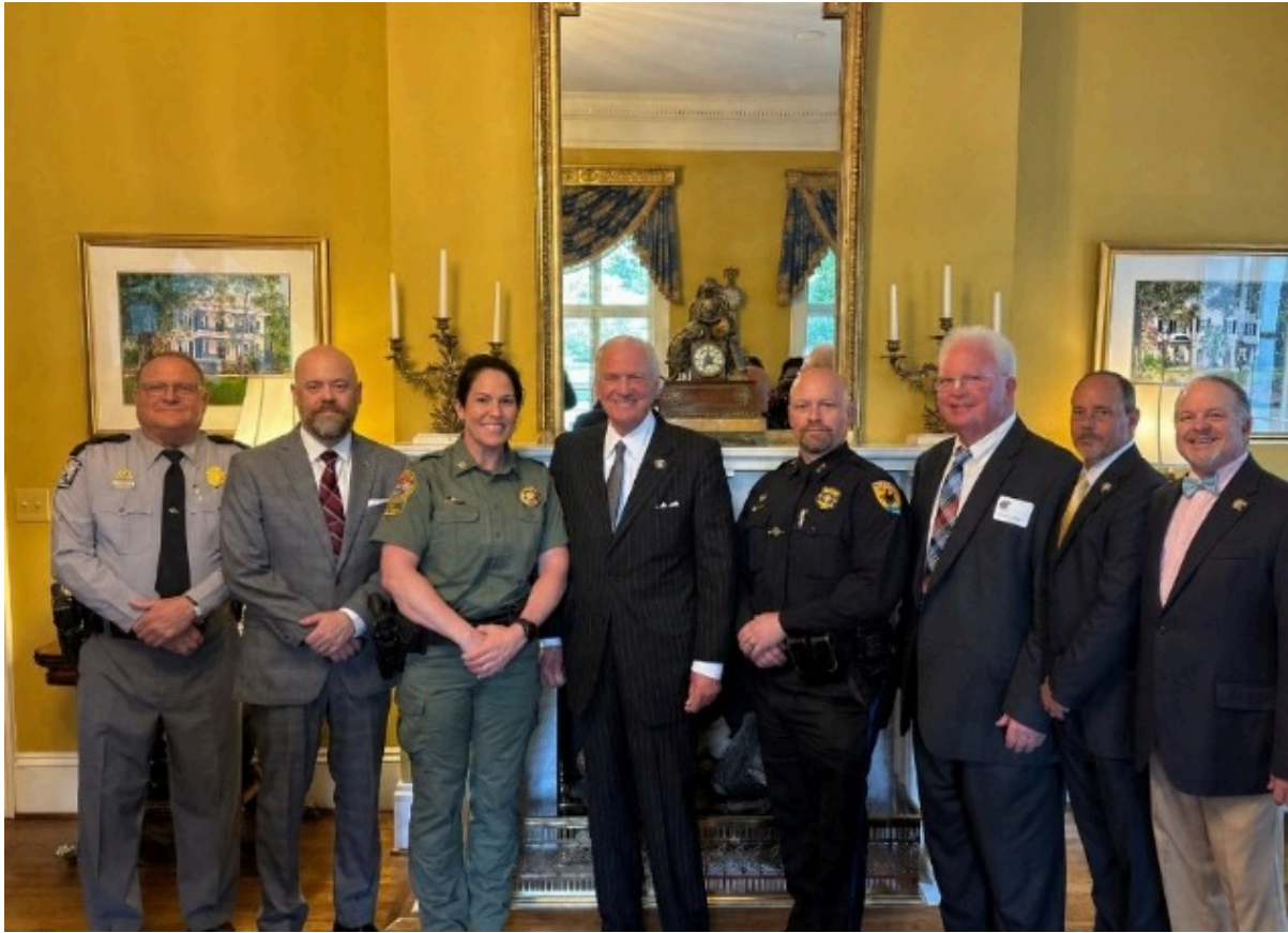
South Carolina FBINAA Board Members