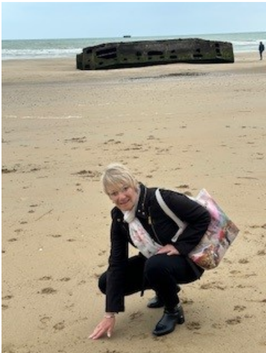
80th Anniversary of D-Day