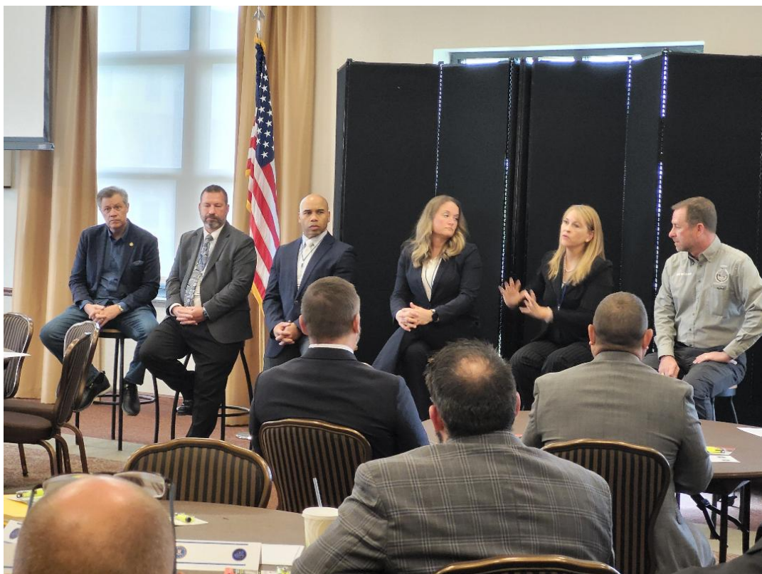
GLLS class panel with instructors and students, Niagara Falls, NY