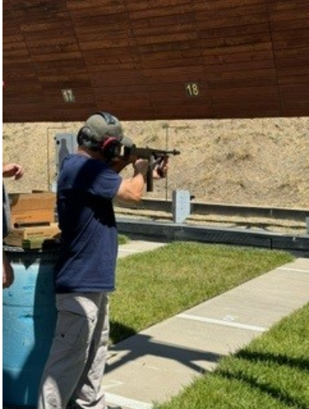
Photo of retired San Jose Police Department members attending the SF Division Shoot-June 9th, 2024.